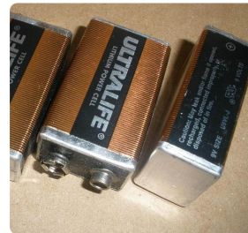
Silver Bottom U9VL-BP

NOTE: All Energizer Lithium-Ion 9V batteries are also acceptable.